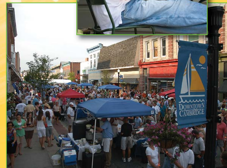
Annual Taste of Cambridge event, downtown Cambridge, MD.