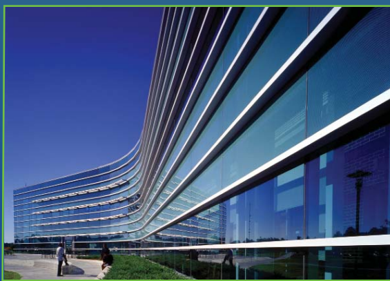
Chesapeake College Learning Resource Center, Wye Mills, MD. A satellite site of Chesapeake College is located in Cambridge, MD.

Visit Dorchester County and discover why it is a great place to live, work, play and do business!