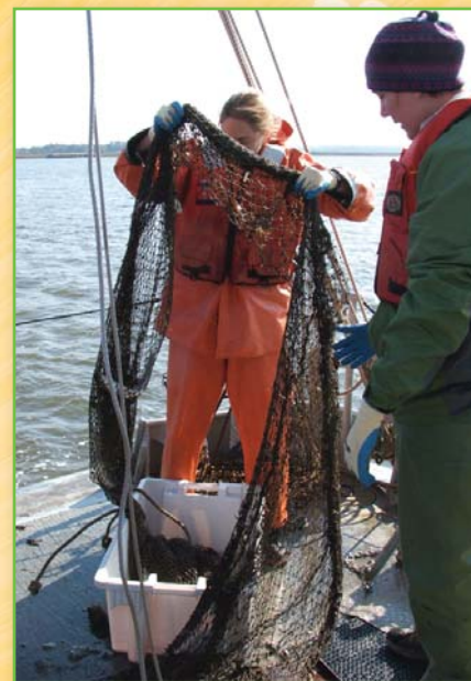
University of Maryland Center for Environmental Sciences, Horn Point Laboratory, Cambridge, MD.

The Cambridge-Dorchester Regional Airport is conveniently located adjacent to the Business and Technology Park. A planned expansion of the airport will extend the runway from 4,476 feet to 5,400 feet to allow for larger aircraft service. Since the airport is out of the restricted zone, takeoffs and landings involve little or no delays.