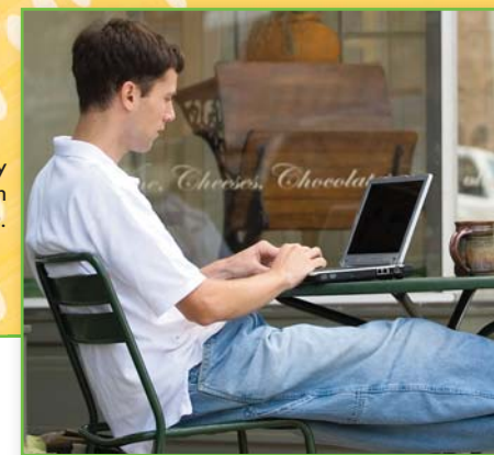
Wireless capability in downtown Cambridge, MD.