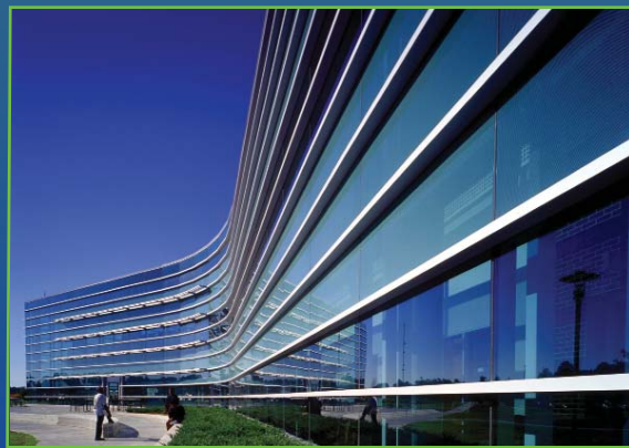
Chesapeake College Learning Resource Center, Wye Mills Campus.

Visit Dorchester County and discover why it is a great place to live, work, play and do business!