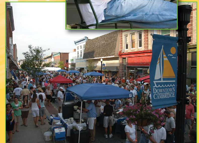
Annual Taste of Cambridge event, downtown Cambridge, MD.