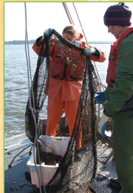
University of Maryland Center for Environmental Sciences, Horn Point Laboratory, Cambridge, MD.

The Cambridge-Dorchester Regional Airport is conveniently located adjacent to the Business and Technology Park. A planned expansion of the airport will extend the runway from 4,476 feet to 5,400 feet to allow for larger aircraft service. Since the airport is out of the restricted zone, takeoffs and landings involve little or no delays.