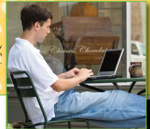
Wireless capability in downtown Cambridge, MD.